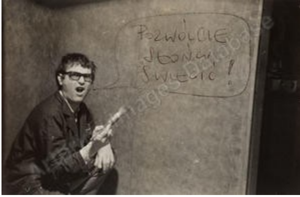
2600 złotych, Desa 19 IV 2018